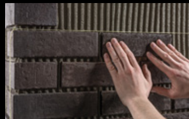
Use a string to plumb the clinker area. The clinker slips are pressed into the adhesive bed.