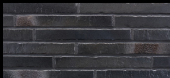
Glanzstück № 6 \Delta < 3\% - DIN EN 14411, Gr. A b