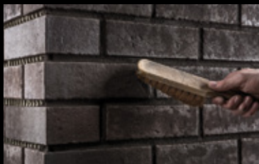
Sweeping out the joint gives it a corresponding structure.