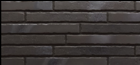
Glanzstück № 1 \Delta < 3\% - DIN EN 14411, Gr. A b