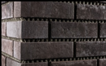
The finished surface. Grouting can be done after the appropriate drying time.