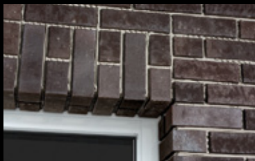
Window lintel perfectly replicated with angles.

JOINTING: After applying the clinker slips and after a corresponding drying time (see the adhesive manufacturer's instructions), a start can be made on grouting. Clinker slips with smooth surfaces can be processed by the slurry method. There are a number of grouts on the market but some have plastic and pigment additives. For this reason, you should always consult the mortar manufacturer regarding suitability before choosing the grout. All rough, patinated and textured surfaces are grouted with a conventional pointing trowel and a metal float.