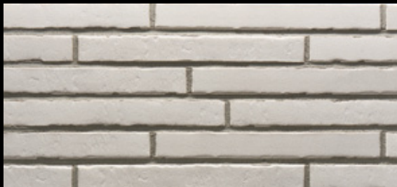
Glanzstück № 3 \Delta < 6\% - DIN EN 14411, Gr. A II - Part 1