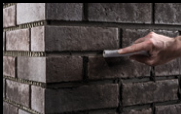
Jointing with a trowel allows you to create different looks.