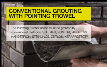
Grouting using pointing trowel and metal float along the horizontal.