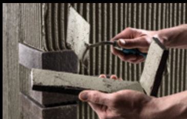
The corner angles are worked using the floating-buttering method.