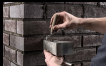
The vertical joints can be finished more easily with a smaller pointing trowel.