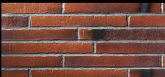
Glanzstück № 5 \Delta < 6\% - DIN EN 14411, Gr. A II - Part 1