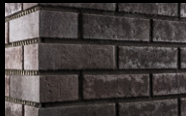
The finished joint pattern. Full masonry stretches are grouted at one go.