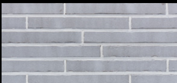
Glanzstück № 7 \Delta < 3\% - DIN EN 14411, Gr. A b