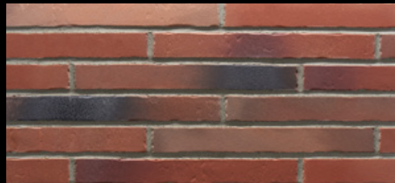
Glanzstück № 2 \Delta < 3\% - DIN EN 14411, Gr. A b